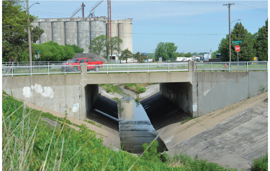
The Deadmans Run Flood Reduction Project includes widening the channel, meaning this bridge at 33rd Street and others at 38th and 48th streets will need to be replaced.

LPSNRD and the City of Lincoln (City) will split the remaining cost for these improvements, totaling about $2.5 million each.