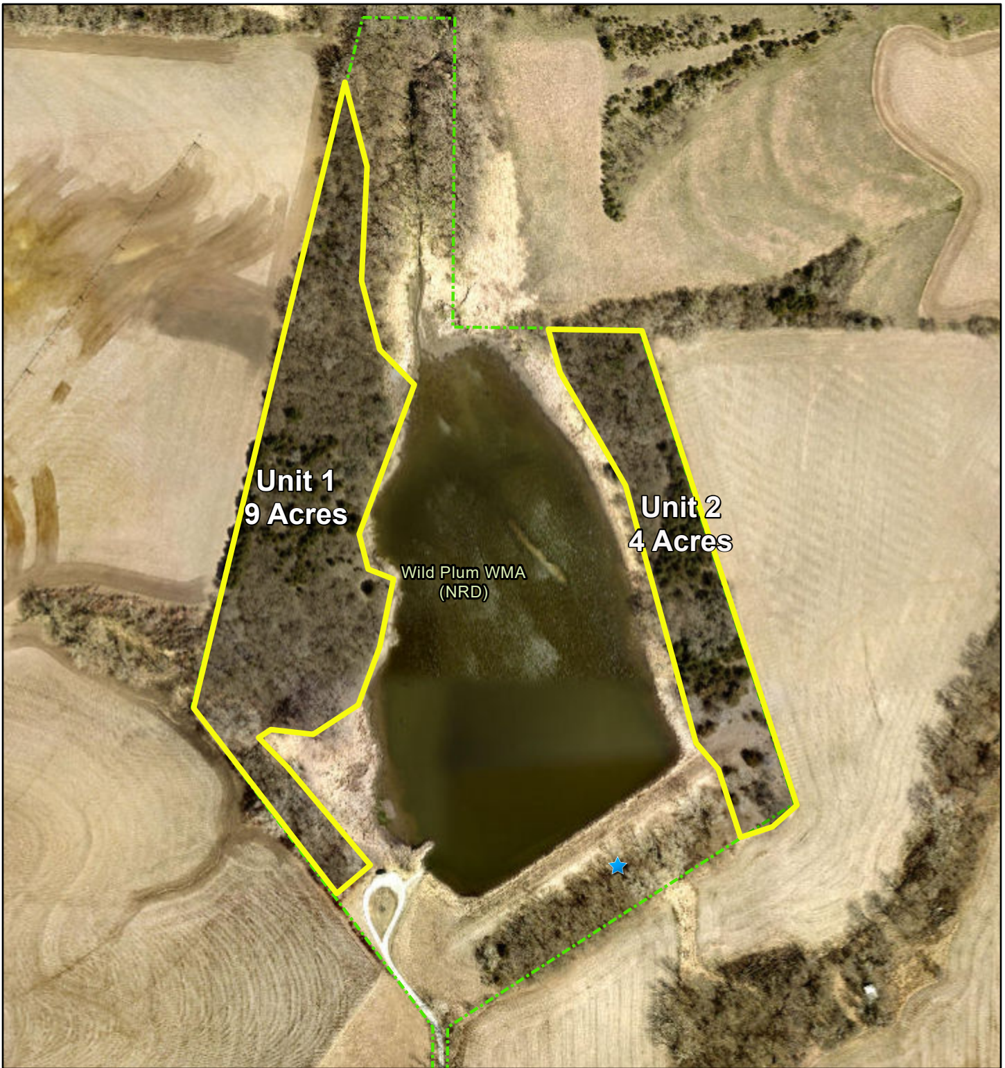
Exhibit B - Wild Plum WMA Tree Clearing 2023