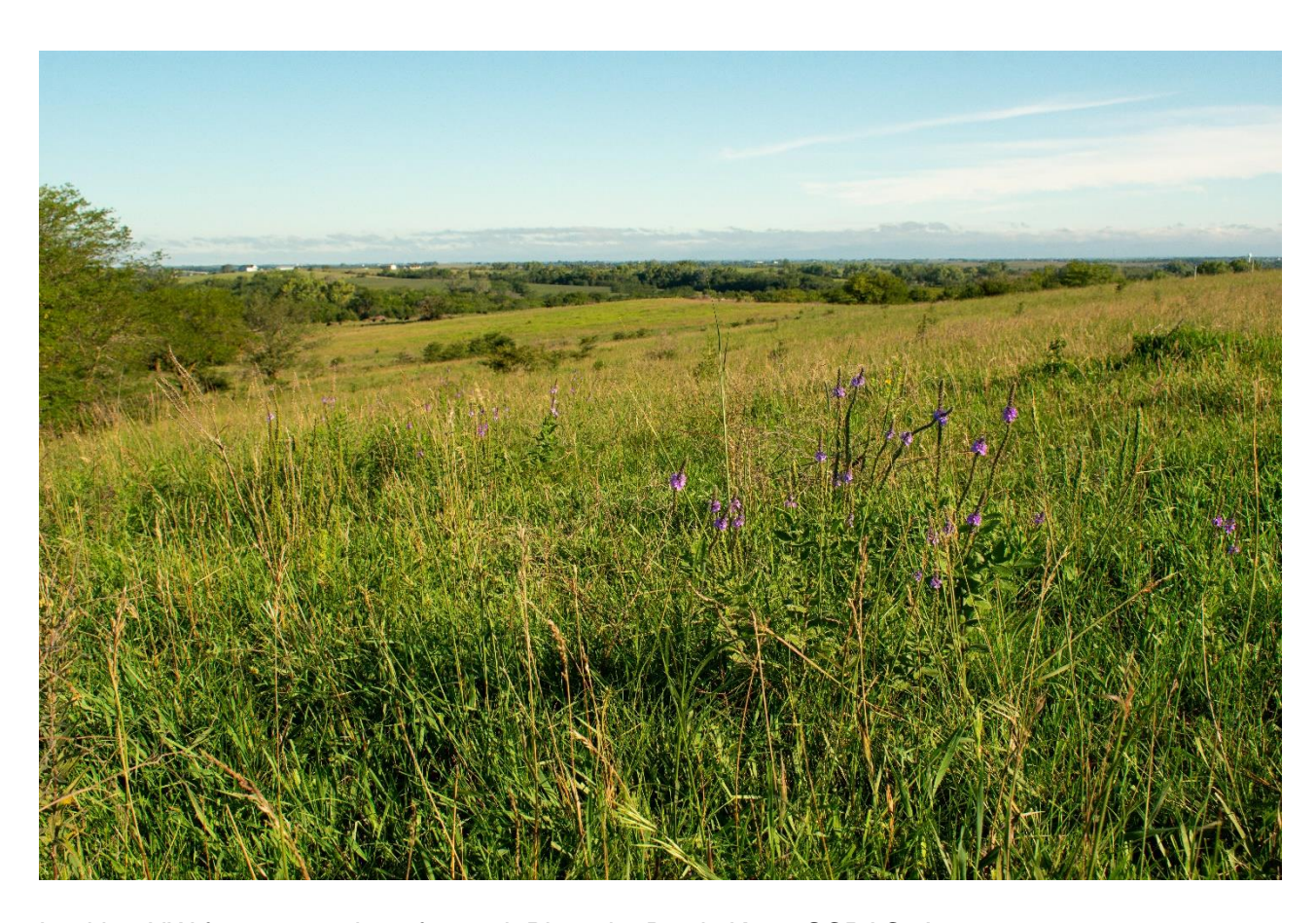
Looking NW from east edge of parcel. August 15, 2023