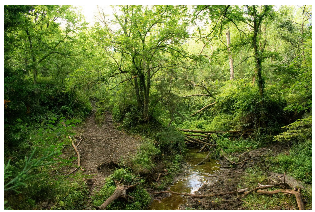
Looking north at Spring Creek. Photo by Brady Karg, August 15, 2023.