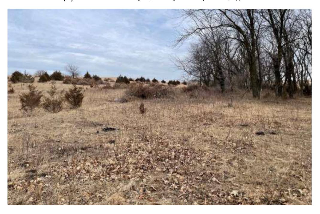
Looking east along the south boundary of the property in the SW \frac{1}{4} on the east side of Spring Creek. (6) Photos taken July 15, 2022 by the Marilyn Tabor, Appraiser.

in the SW1/4. (5) Photos taken February 12, 2023 by the Marilyn Tabor, Appraiser.