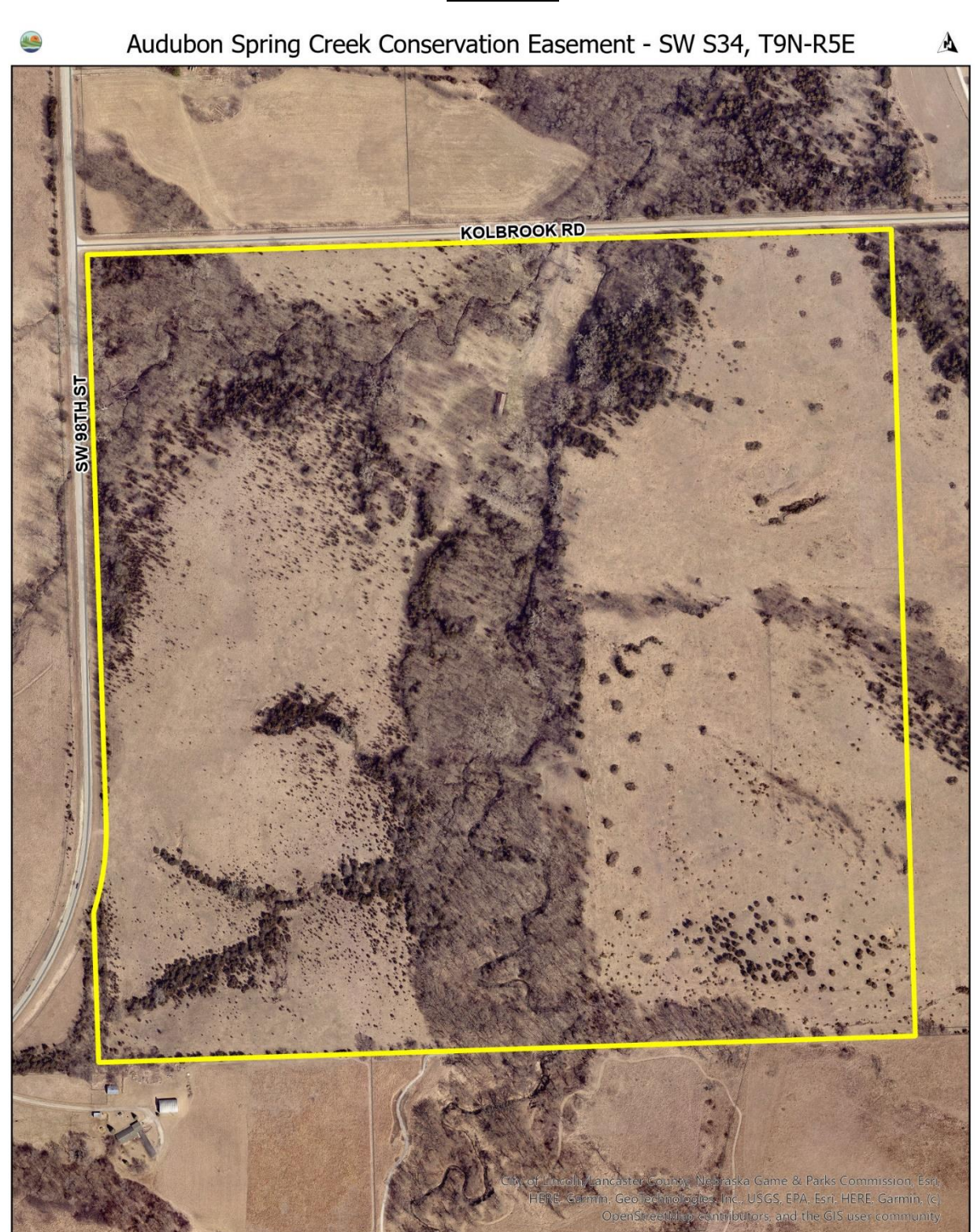
Map Created: January 2024 - LPSNRD, sdr