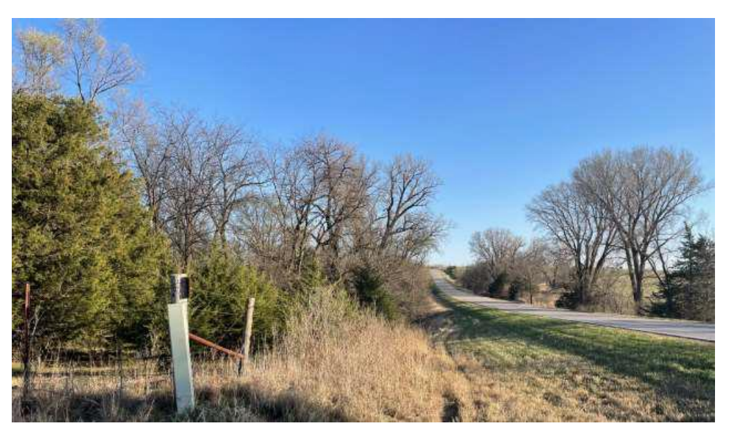
Looking south along SW 98th Street, the west boundary, from the northwest corner of the subject. (15)