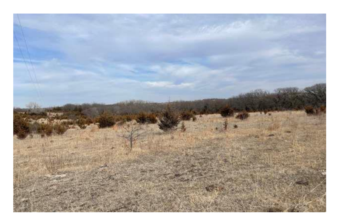
Looking east from the south boundary across the SW \frac{1}{4} . (3) Photos taken February 12, 2023 by the Marilyn Tabor, Appraiser.