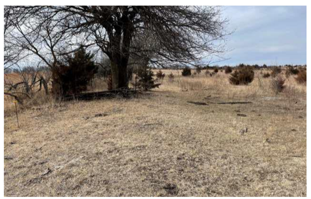
Looking west along the south boundary of the SW¼. (photo by Marily Tabor, February 2023)