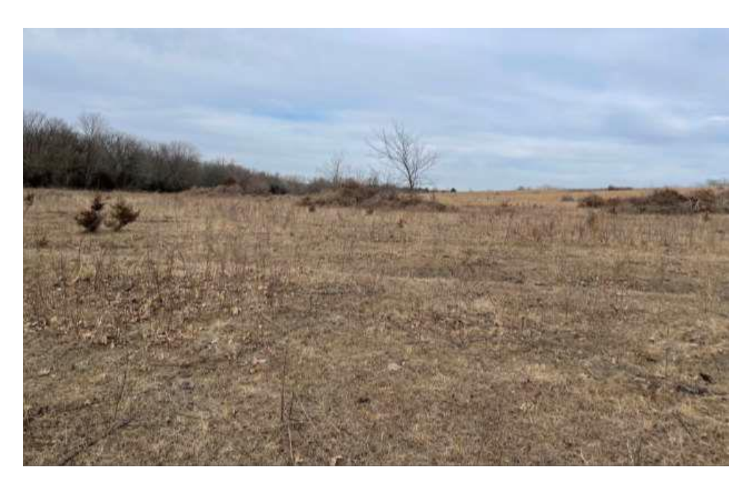
Looking north from the east side of Spring Creek from the furthest south point of the creek

in the SW1/4. (5) Photos taken February 12, 2023 by the Marilyn Tabor, Appraiser.