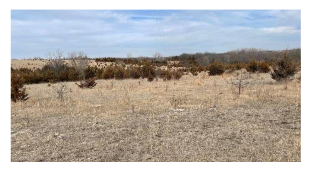
Looking north from the south boundary of the property across the SW \frac{1}{4} . (2) Photos taken February 12, 2023 by the Marilyn Tabor, Appraiser.