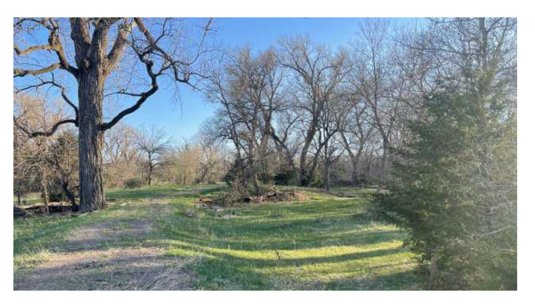
Looking south along the west side of Spring Creek on Kolbrook Road. (13) Photos taken April 16, 2023 by the Marilyn Tabor, Appraiser