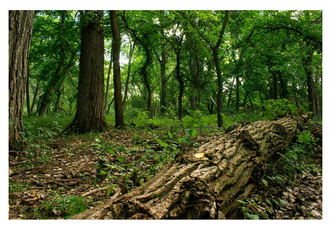
Looking SE from an alluvial fan in the woodland area. Photo by Brady Karg, SCPAC, August 15, 2023.