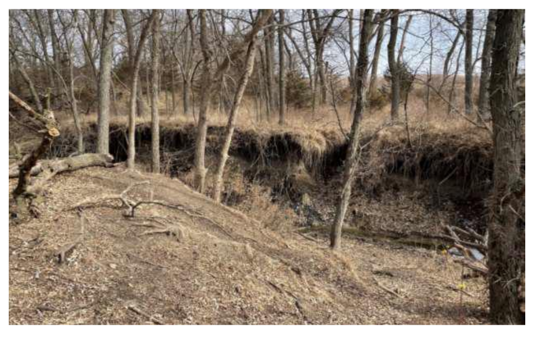
Spring Creek looking north from the west bank on the furthest south point of the creek in the SW\frac{1}{4}. (4)