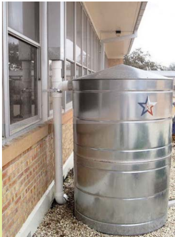
Rainwater Harvesting System

The City of Lincoln requires certain permits and plans be in place before contractors can begin construction work and the NRD is a key part of that process. These safeguards help protect adjacent landowners from sediment erosion, flooding and they help improve water quality in